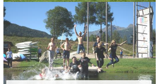
Whole grade overnight field trip