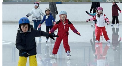
Elementary swimming / ice skating