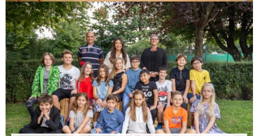
Professional school photos